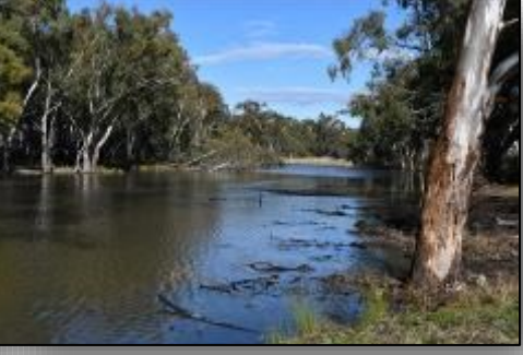
Colombo Creek - Willows 2021 before and after - June 2022. What a difference!